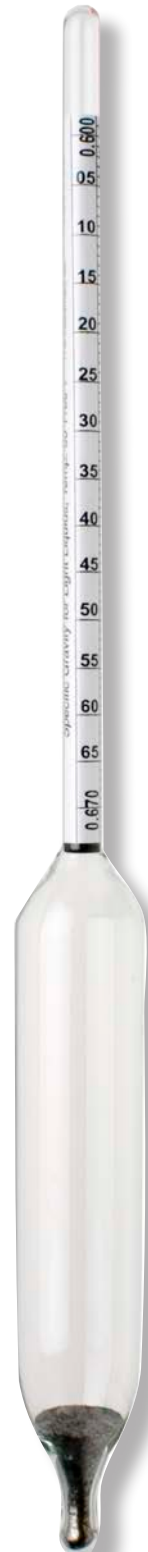
Specific Gravity Hydrometer